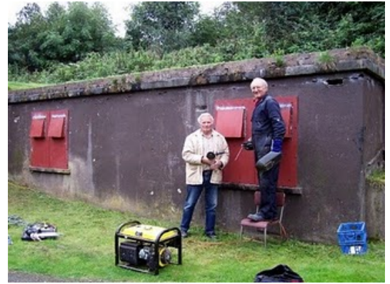
Right: The ventilation boxes in place on the War Shelter